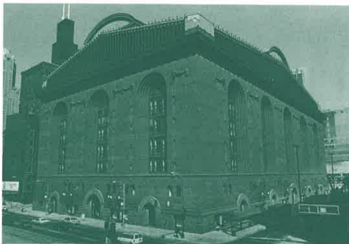
The new Harold Washington Library in downtown Chicago.