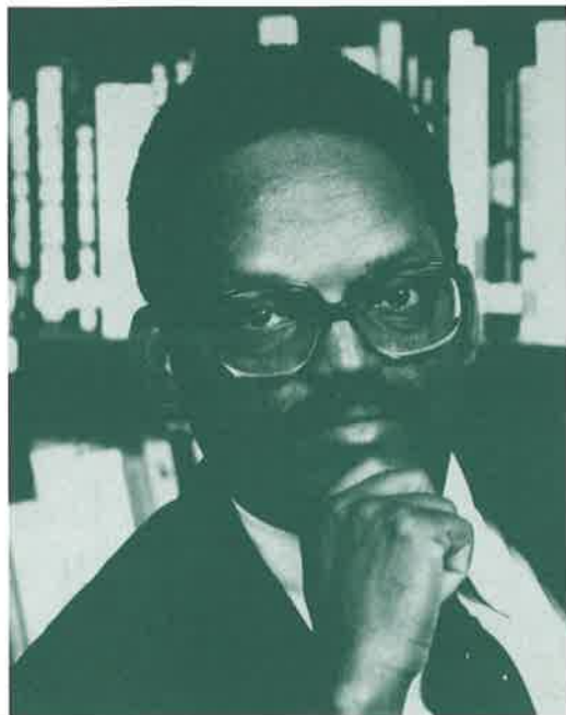
UHA luncheon speaker at the OAH, William Julius Wilson